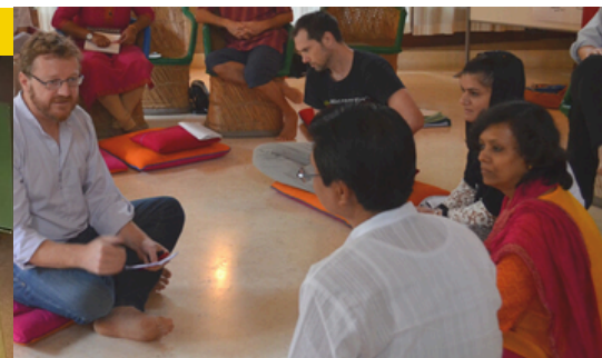
REFLECTIVE AND INTERACTIVE