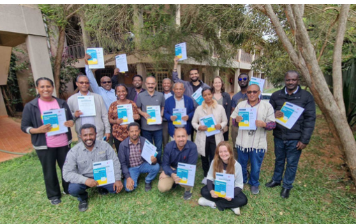
MASTERCLASS GRADUATES OF 2024